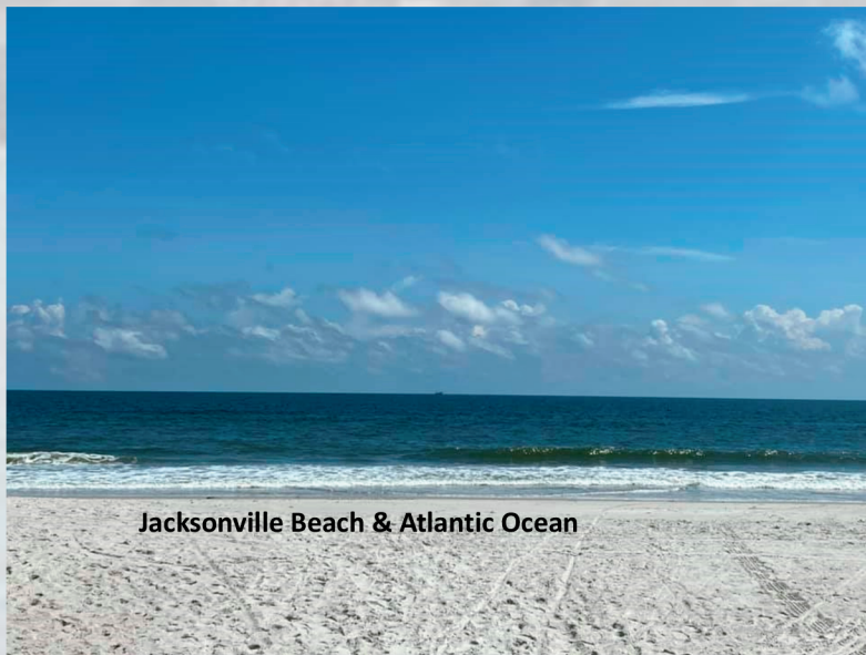
Jacksonville Beach & Atlantic Ocean

Early to rise, we leave Georgia for the beautiful beaches of Jacksonville Beach, FL . This coastal resort city offers sun, sand and surf, along with sightseeing attractions and shopping. We will take time to relax and enjoy this part of the “sunshine” state.